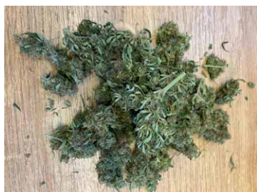
Fig. 1: Cannabis flower buds before the grinding process

Cutting mills are widely used for grinding of soft, medium-hard, tough, elastic, fibrous samples, and heterogeneous material mixes.