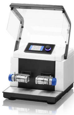
Fig. 6: Mixer Mill MM 400

The so-called QuEChERS method ("quick, easy, cheap, effective, rugged and safe") was developed to make sample preparation to pesticide residue analysis more efficient. It basically consists of three steps: Homogenization – Extraction – Analysis. During the homogenization process, care must be taken that the sample does not get too warm as some pesticides are volatile. After the homogenization, 10 g of the pulverized hemp sample are extracted with 10 ml acetonitrile. In the next step, the organic phase is dried and tested for pesticides with chromatographic analysis. To avoid ghost peaks in the chromatograms, the sample is extracted in the presence of a salt mixture (e. g. sodium chloride and magnesium sulphate in a 1:2 ratio). To transfer the pesticides from the sample into the organic phase, the mixture is agitated for 1 to 3 minutes with acetonitrile and salt. The mixture can be agitated in a laboratory mill like RETSCH's Mixer Mill MM 400. It shakes the sample in a 50 mL Falcon tube with a frequency of up to 30 Hz, thus ensuring thorough mixing of the sample to improve subsequent extraction.