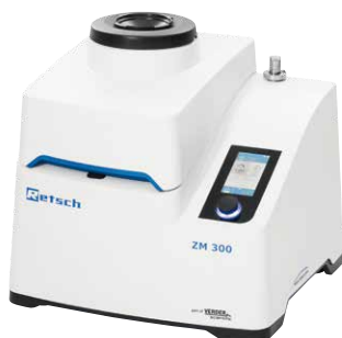
Fig. 4: Ultra Centrifugal Mill ZM 300

The Ultra Centrifugal Mill ZM 200 is the ideal mill for pulverizing granules like grains or fibrous samples like hemp plants. It achieves a maximum speed of 18,000 min -1 and can be equipped with a large range of accessories, allowing for adaption to the sample's requirements. The shearing forces between rotor and ring sieve facilitate successful size reduction of fibrous materials. Hemp contains oil which makes it a temperature-sensitive material; to reduce heat build-up during grinding, it is recommended to use a distance sieve. Thanks to a small gap between the sieve and the rotor, the shearing forces and the formation of heat are reduced. 20 g of the pre-cut hemp flowers can be ground to a particle size smaller than 0.5 mm by using a 0.5 mm distance sieve at a speed of 18,000 min -1 . The use of a cyclone has a cooling effect on the sample and helps to efficiently discharge the material from the grinding chamber. The pulverized sample is now ready for, e. g. extraction of pesticides with the QuEChERS method.