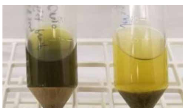
Fig. 8: The hemp sample milled in the CryoMill (left) yields a higher pesticide amount after extraction than the sample milled in the ZM 300 (right).

Testing labs need reliable solutions for grinding several Cannabis samples each day, the sample amount to be ground varies from 4 to about 30 g per sample. Often they are facing difficulties because of sample residues, as flower buds are sticky due to their oily content. Thus, cleaning effort is a time factor for testing labs. A classic grinder is often used, as the residues are in a tolerable range. Grinding 30 g flower buds needs approximately 15-30 min, depending on the sample's properties, and cleaning another 5-10 min. The Mixer Mill MM 400, which can be equipped with 8 x 50 ml Falcon tubes, offers a very comfortable and fast solution. Per tube, around 4 g flower buds can be ground, thus 32 g in one run, if larger sample amounts are required, or up to 8 different samples. Grinding balls and sample material is frozen at -22°C before grinding. In each tube 2 x 15 mm grinding balls stainless steel are added, grinding is then performed at 25 H for only 2 min. Cleaning of the balls is very easy – just rinsing with acetone is required. The tubes are disposed after use. Sample loss is in a range of 4-5%, which is tolerable. Despite the time factor, the MM 400 offers another advantage over the Grinder: The relative standard deviation is usually less in samples homogenized in the MM 400, for example from 5% to 2% in the case of d9-THC.