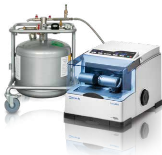
Fig. 7: CryoMill with 50 l dewar

automatic pre-cooling function ensures that the grinding process does not start before a temperature of -196°C is reached and maintained. The pre-cooling time was set to 3 min at 5 Hz. Grinding was done at 30 Hz for 3 min. Thanks to the autofill system of the CryoMill, the user never comes into contact to liquid nitrogen, the machine keeps the temperature at -196°C during grinding. The embrittled sample can now be ground to much smaller particle sizes than in the ZM 200. Still, for larger sample quantities, the ZM 200 is a suitable choice.