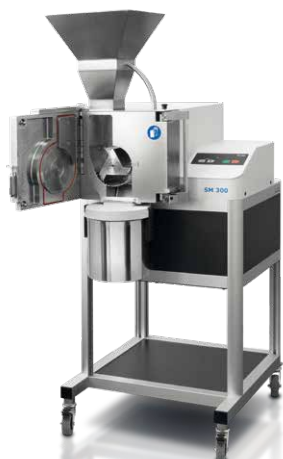
Fig. 2: Cutting Mill SM 300 foodGrade

If larger sample particles 5-15 mm are required, e. g. for ethanol extraction, simply select a bottom sieve with larger apertures, e.g. 10 mm, and select a lower speed, e.g. 700 rpm. This results in larger particles, and less warming effects. The sample throughput was the same as mentioned above when using a 4 mm bottom sieve at 3000 rpm.