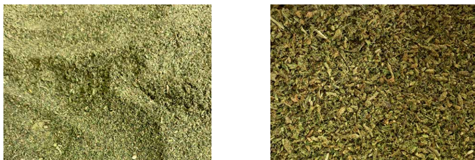
Fig. 3: Cannabis after grinding in the SM 300 foodGrade, left: using a 4 mm bottom sieve and grinding at 3000 rpm, right, using a 10 mm bottom sieve and grinding at 700 rpm