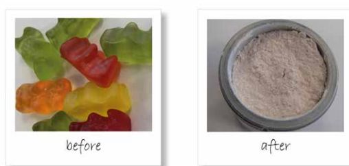
Fig. 9: Jelly bears before (left) and after cryogenic grinding in the Mixer Mill MM 400

Cryogenic grinding in the CryoMill offers the advantage of continuous cooling of the grinding jar with LN 2 . This consistent temperature is guaranteed even for long grinding times without the need for intermediate cooling breaks. For heavy-metal-free grinding a zirconium oxide grinding jar should be used. A few pieces of liquorice, one praline or similar samples are typically pulverized in the CryoMill.