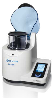
Fig. 10: Knife Mill GRINDOMIX GM 200

The Knife Mill GM 200 is designed for thorough homogenization of samples with high water, oil, sugar or fat content. It accepts sample volumes up to 700 ml. Thanks to the powerful 1000 W drive, the mill can homogenize even difficult samples very quickly and efficiently without blockages or the need for more than two grinding steps. The innovative Boost function allows for a temporary speed increase to 14,000 min -1 , providing extra power for the homogenization of difficult samples in a very short time. The mill may be operated in three different modes: standard mode = cutting, reverse mode = impact, interval mode = improved sample mixing, to optimize the homogenization process with regard to the material properties. Up to 8 programs can be stored for routine applications. The possibility to save 4 program sequences is helpful when combining two grinding steps, for example, pre-crushing in impact mode followed by fine grinding in cutting mode, or if two different speeds are required. Pulverization of 8 large cookies was performed in two steps. In the pre-grinding step at 4,000 min -1 , the interval mode was used for 10 seconds to improve mixing of the sample. The use of the standard lid ensures that the sample can move freely in the container, thus reducing the heat development (and subsequent fat release). In the homogenization step, which takes 35 seconds at 10,000 min -1 , the use of the reduction lid 0.5 l is preferable to force