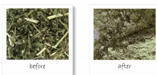
Fig. 5: After pre-cutting in the SM 300 (left) the sample is pulverized to <0.5 mm in the ZM 300.