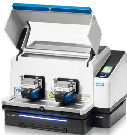
Fig. 1: MM 500 control with cryoPad

For these applications RETSCH has developed the new Mixer Mill MM 500 control, which can cool two grinding jar positions with grinding jars up to max. 125 ml simultaneously. The heart of the MM 500 control are the flexible tempering options. Where, for example, the RETSCH CryoMill exclusively uses LN 2 as a cooling medium so that the samples always reach temperatures in the range down to -196°C, the MM 500 control offers various cooling and also heating options. By connecting to either a chiller, a cryostat or RETSCH's innovative cryoPad, which regulates the flow of LN 2 , temperatures in the range of -100°C to +100°C can be generated with various thermofluids. This opens up completely new possibilities especially in the field of research and development, in mechanosynthesis or also for applications with polymers or food.