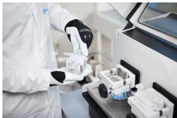
Figure 2: Deeply frozen grinding jars after cryogenic grinding with the MM 500 control

During a grinding or mechanical synthesis process a certain sample temperature is established. This depends on the sample type, the grinding jar volume and material, the ball size and number as well as the frequency/speed and process time. Since often only the last two parameters can be freely selected, a temperature development above 100°C is not unusual, especially in the case of nanogrinding or, generally, in the case of longer grinding processes with larger balls. Without active cooling options, excessive temperatures can only be reduced by using cooling breaks.