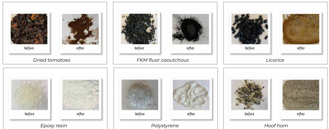
Figure 6: Different materials before and after grinding in the MM 500 control