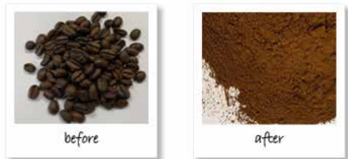
Figure 3: Left: Roasted coffee before and after grinding in the MM 500 control (per 125 ml stainless steel grinding jar: 5.4 g coffee, 8x20 mm stainless steel grinding balls), set temperature -100°C, 25 min pre-cooling time, grinding in 10 cycles (1 min 30 Hz + 0.5 min 5 Hz).