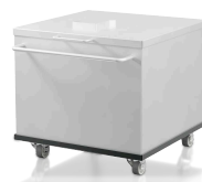
Collecting receptacle 30 l