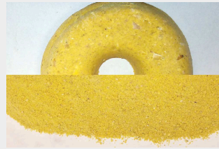
храна за животни