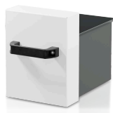
Collecting receptacle 10 l