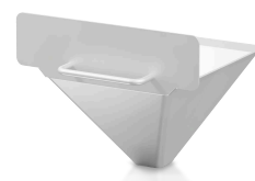
Gravity outlet for continuous operation